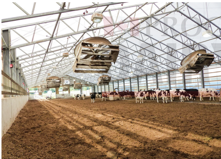
Shuler Dairy focuses on cow comfort with a compost-bedded pack barn and hybrid tunnel ventilation system.