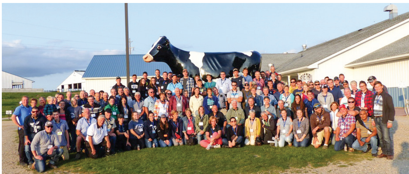
In August, around 100 people filled two coach buses to tour farms in Michigan and Indiana. The group is pictured here outside the MOO-ville Creamery in Nashville, Michigan.

• WK Kellogg Biological Station, Hickory Corners, Michigan – This