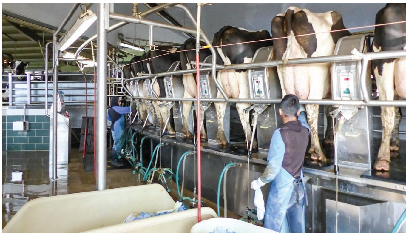
A 72-stall rotary parlour at Vanderploeg Friesians' 3,500-cow dairy in Ithaca, Michigan.