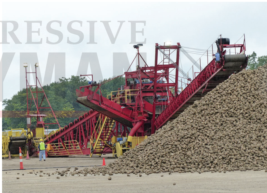
The Michigan Sugar plant processes 4,200 tons of beets a year.